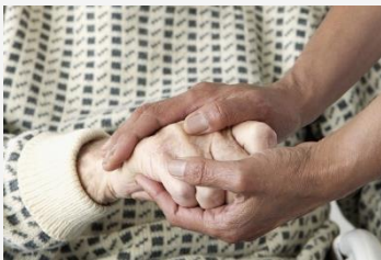
Elderly & Vulnerable Client Services