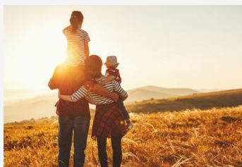
Wills & Succession Planning